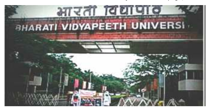
(Volunteers of IMED with Zoo – Zoo character at Bharati Vidyapeeth University, Katraj.)