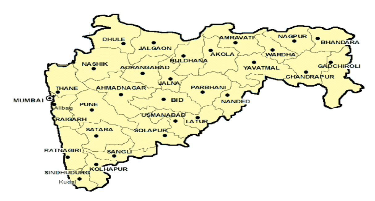
MAP:- III no-1 Maharashtra state Map

Maharashtra is prime educational destination of the well known universities. The universities in Maharashtra are helping to enhance the education excellence. There are many universities in Maharashtra that truly provides high quality education for every one aside from multi cultural zeal and their qualified faculties, the university in Maharashtra are not only producing quality research operations. The head of all the universities is the Governor itself and concern with deemed university founder is the chancellor of the university.