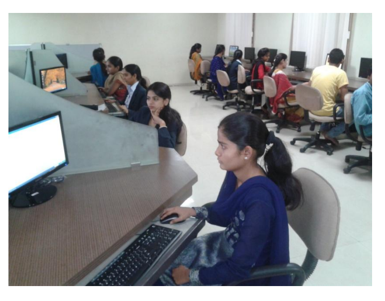
All the computers have protected by Quick Heal Console Unit.

All these computers are in LAN and have a well powered backup. The Information System Centre is professionally managed and equipped.